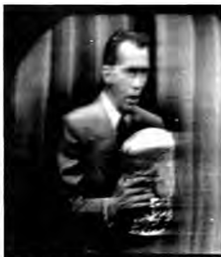
I'LL EAT YOUR HAT: That statement back-fired on TV Star Ed Sullivan. This is how it appeared on home TV sets over the nation.